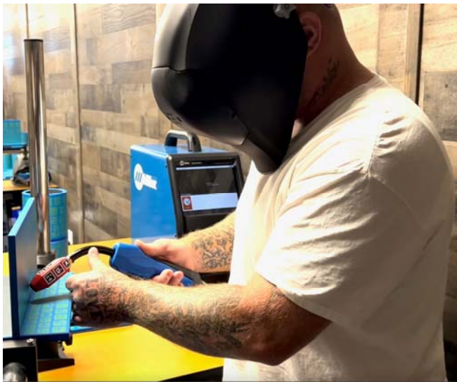
Welding 4 – An inmate practices his skills in welding using the MDOC’s new Mobile Welding Training Center in learning a trade for job opportunities after his release from prison.