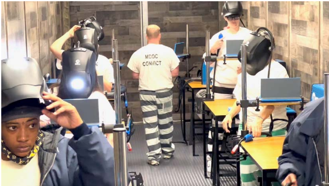
Welding 6 – Female inmates will also have an opportunity to gain skills in welding using the MDOC’s new Mobile Welding Training Center in learning a trade for job opportunities after their release from prison.