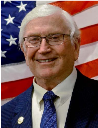
MDOC Commissioner Burl Cain

https://www.facebook.com/MississippiDepartmentOfCorrections/ https://twitter.com/MS_MDOC